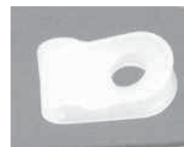
Nylon Cable Clamp 8681 - 1/4" dia. 7412 - 5/16" dia.

GEORGE RISK INDUSTRIES, INC. G.R.I. PLAZA KIMBALL, NE 69145